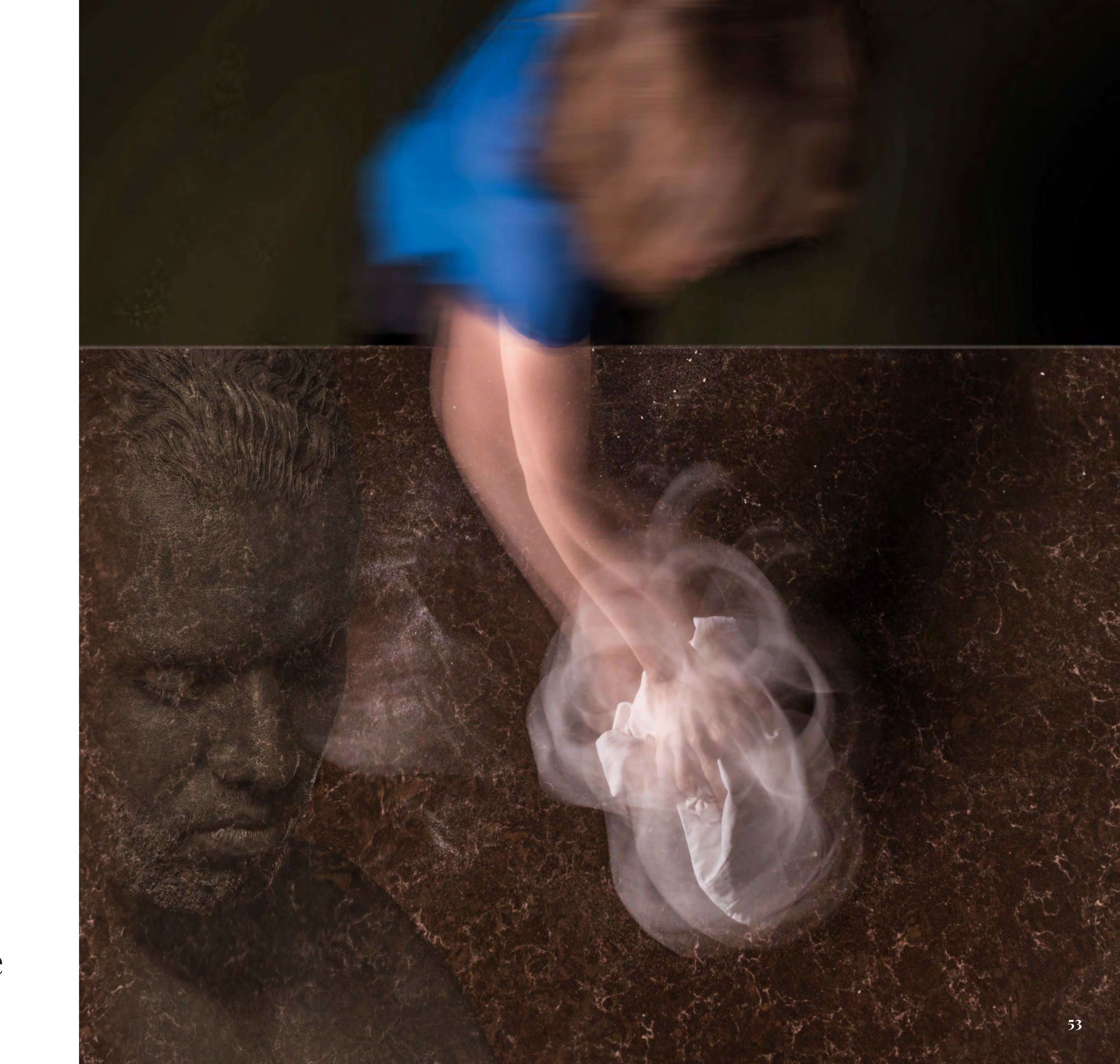
Care & Maintenance